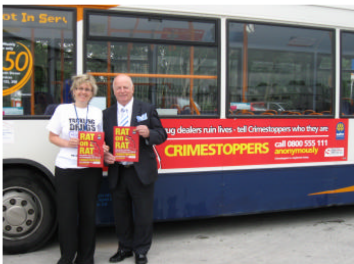
Launch of 'Rat on a Rat' Campaign

Safer North Devon launched Crimestoppers 'Rat on a Rat' campaign to encourage residents to call Crimestoppers (0800 555111) anonymously to report any suspected drug dealing in their neighbourhood.