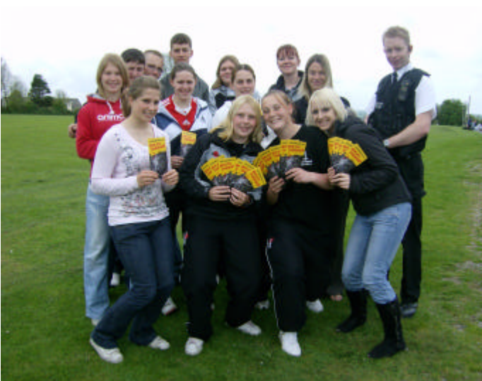
North Devon College students design a new teenage anti-social behaviour leaflet

"We listen to and act upon ideas and contributions from the public and work on solutions to address these. Every problem is unique, every community has different needs and we try to address these by supporting partners to deliver expanded local services."