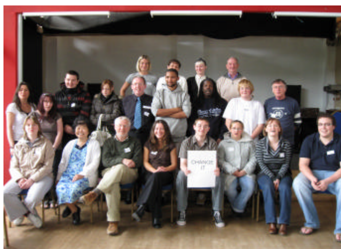
Bringing generations together in East Bideford

We now work as an inter-agency team with shared priorities driven by local need. We actively seek referrals for individuals and families where complex needs are identified. This includes mediation, restorative justice, parenting support, youth inclusion support, alcohol and drug treatment, housing advice and diversion projects to prevent re-offending or repeat ASB by providing positive activities or structured support for individuals.