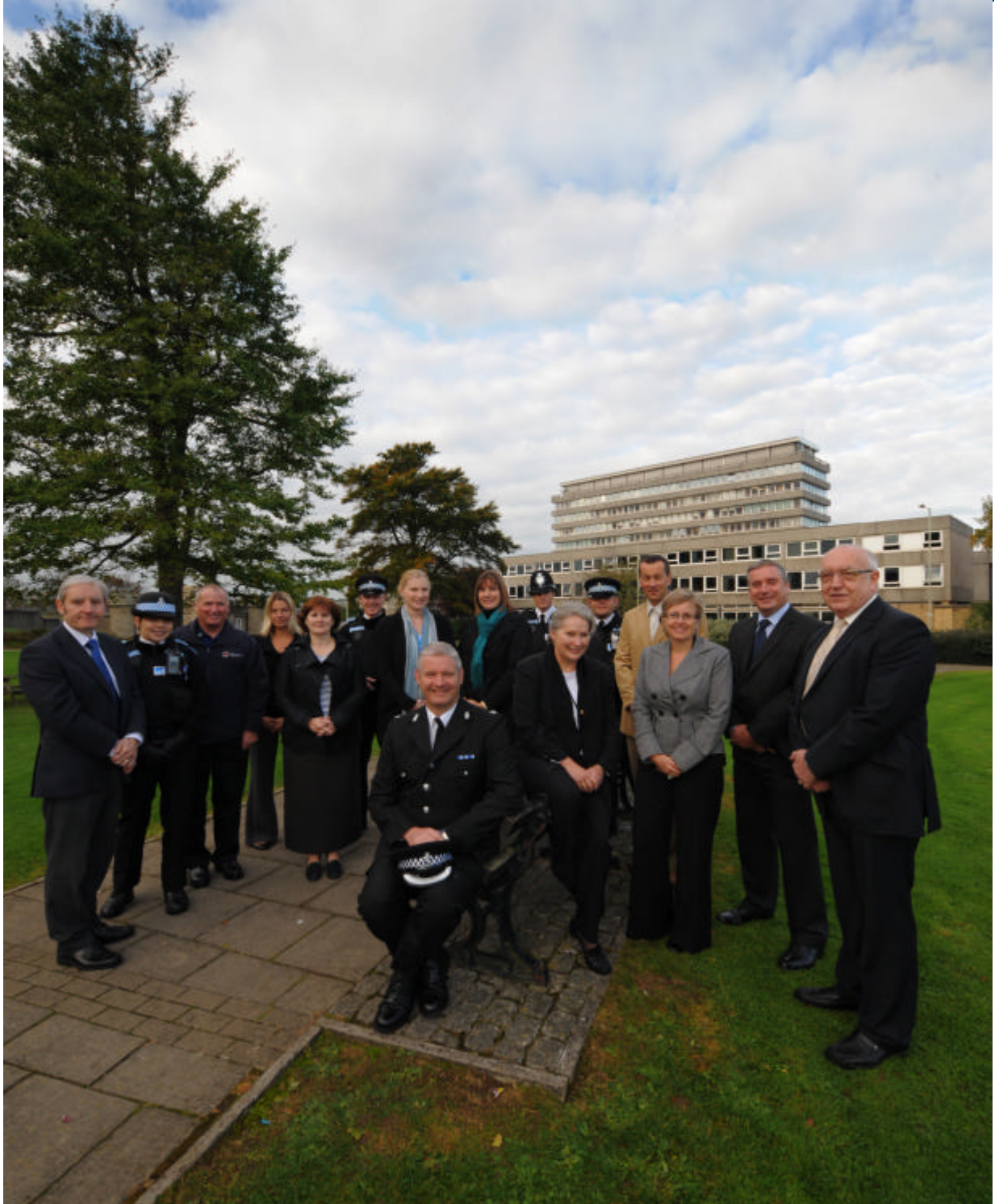
Safer North Devon: Devon and Somerset Fire and Rescue Service, Devon County Council, Devon and Cornwall Probation, North Devon Youth Offending Team, Devon and Cornwall Constabulary, Devon Primary Care Trust, North Devon Council, North Devon Magistrates Court and Torridge District Council

Page 12 - Street Champions Scheme & Win a £20 M&S voucher in time for Christmas