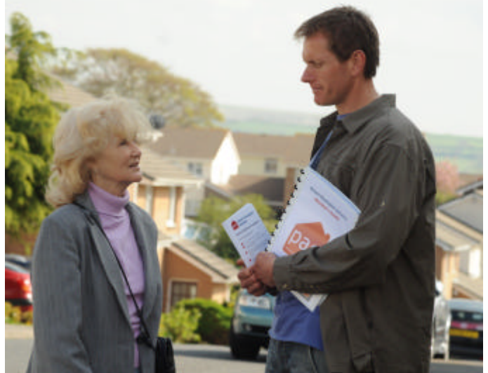
Launch of Street Champions

The scheme is supported by local Police, Councils, Devon and Somerset Fire and Rescue Service, Devon and Cornwall Watch Association, Neighbourhood Watch and local Housing Associations .