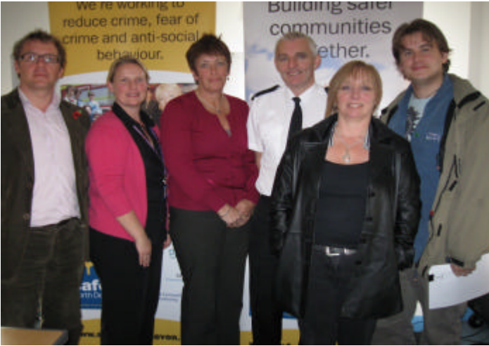
Partners working with A&E at North Devon Hospital raising awareness of community alcohol support services

The risk of becoming a victim of violent crime in Devon is very low with North Devon and Torridge remaining one of the safest places in the country to live. Between 2004/05 and 2007/08 violent crime in Devon reduced by 27.6%.