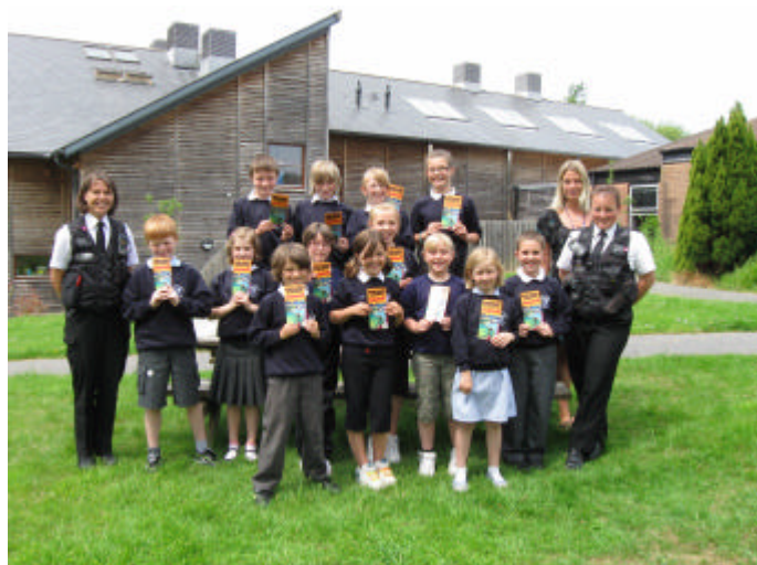
Great Torrington Junior School launch their Anti-Social Behaviour leaflet