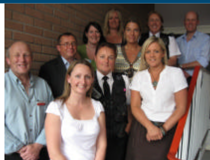
ASB Specialists in key partner agencies (Police, Councils, Registered Social Landlords, Youth Offending team) work jointly on local ASB problem solving

This is a tiered approach which includes low level warning letters, joint agency visits and multi-agency meetings.