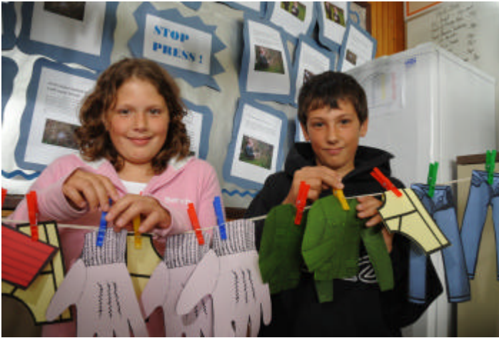
Working creatively with young people to see how they want to spend their holiday time

Partner agencies, responsible for Youth Crime Prevention, set about finding out how young people want to spend their holiday time in a bid to reduce anti-social behaviour and crime during school holidays.