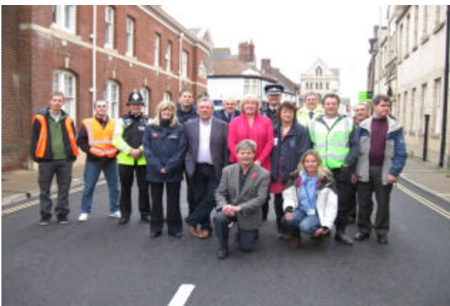
P.R.I.D.E. project launch in Barnstaple

The machine will be used as part of an array of tools used to tackle environmental crime. The P.R.I.D.E. project is an excellent example of how we work together and it will really make a positive difference to our local communities.